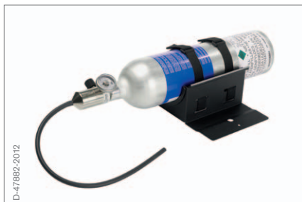
Test gas cylinder holder with test gas cylinder For securing the test gas cylinder to the X-dock Station.