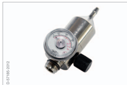
Pressure reducer For connection to the test gas cylinder.