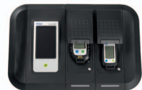
Dräger X-dock 5300 with Pac module.