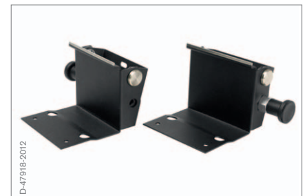
Wall mount Simple mounting option when fitted to a standard DIN rail.